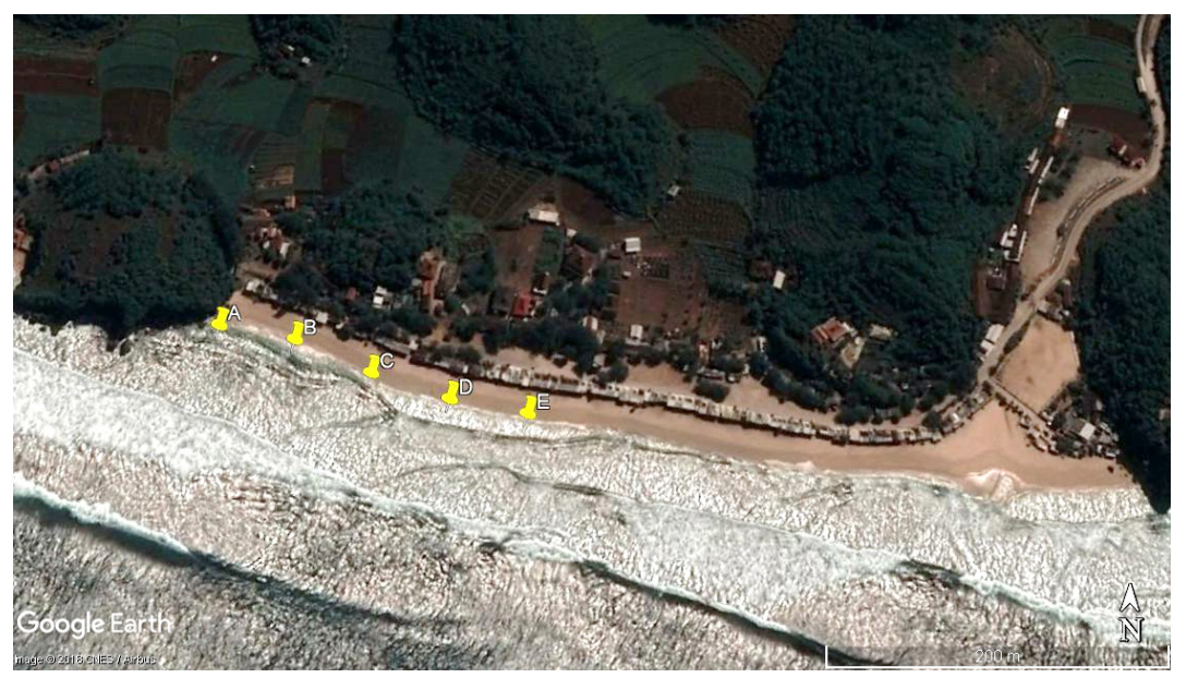
Figure 1. The location of the sampling sites (transects) in Sepanjang Beach

The data will be analysed by using oneway ANOVA to examine the impact of transect locations on the percentage of epiphytes cover. A post-hoc test will be conducted if there was a significant difference on the result.