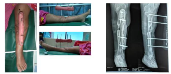
Figure 1. Clinical photograph and x-rays of ankle joint. This pictures showing that the patient presented with open fracture lower 3rd tibia with bone loss. External fixator was applied earlier elsewhere along with k wire fixation for fibula.

the tibia. The patient was initially treated elsewhere and fracture was stabilized with plat and screw, with primary closure of the wound. The patient presented to us with foul smelling wound with copious amount of discharge coming out of it. The patient was then treated with implant removal. and extensive debridement of dead tissues, muscle, and bone was done, resulting in 7 cm segmental bone defect of distal tibia. After repeated serial debridements; on 12th day, the articular fracture was reconstructed and fixation was done with locking compression plate and interfragmentary screw.