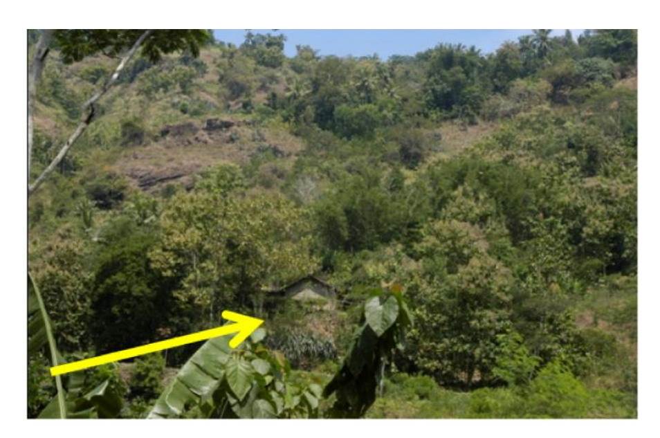
Figure 2. Houses Position in Landslide Area

In research area, rainfall happened in a high intensity that was 2887 mm/year (type B according to Schmidt Ferguson) with the rainy days were 105 days/year