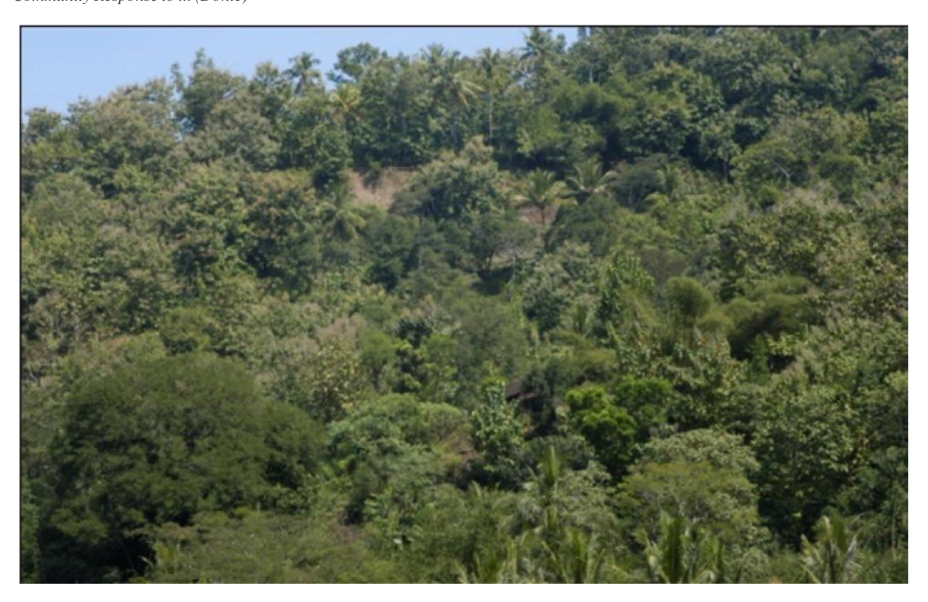
Figure 4. Land Cover of research Site

14% continued their study in a higher level whereas the rest (86%) of people only had elementary level of education.