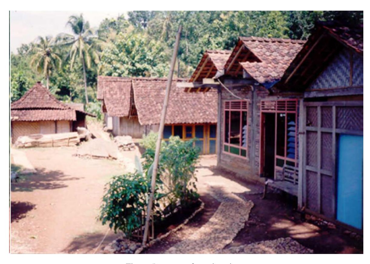
Figure 5. pattern after relocation

by the insistence of community basic-needs to the land for their livelihood. The phenomenon happened as well in 1998 when there was a 'reform movement'. There was an 'anomali' in people circumtance that they could do anything that they want. People did not have any fear on anything including sacred places or sacred jungle. It showed that in any hard circumtance, people could do anything including breaking social values. In his research Sartohadi (2008) stated that to respond to and to cope with the landslide caused by human activities, people should be empowered.