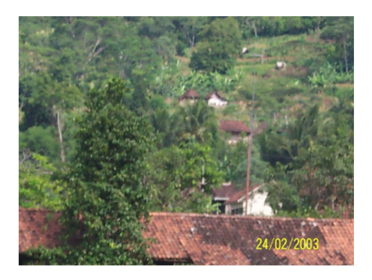
Figure 4. Residential condition before relocation

Chambers (1983) stated that poverty has influenced much to people in fulifilling their needs; both the need for safety and the need for food. The prohibition policy of planting annual crops on sloping lands was insufficiently responded properly. This was caused