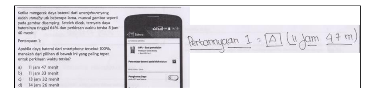
Figure 1. SD's Response on Scientific Context of PISA

In this study, subjects do mistake in reading the main information of the problem hence they did not apply its information in solving problem. Moreover, reading error done by subjects in scientific and personal context of PISA problem.