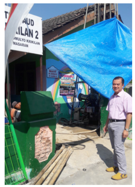
Figure 4. The tunneling process

Once the well was excavated and the PVC pipes with the diameter of 4 dm were inserted to the well's hole, the next process is the test for the well-using pump to measure the water capacity, and also to clean up the water. This is aimed to get the water clean enough, therefore, complying with the requirement to be used by the people.