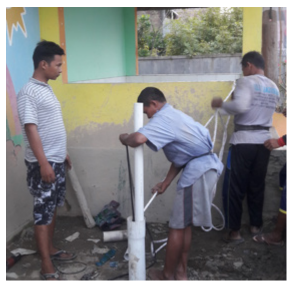
Figure 5. Pump Installation

The installation of the water pump and initial pumping process are respectively shown in Figure 5 and Figure 6. The pumping for cleaning up the well's water took a long time. The process was carried out until the water coming out from the well is quite clear. It was fortunate since, at the time of the pumping process, there are some rice farmlands were dry and some water were needed to keep the rice alive because it was close to harvest time. Therefore, the dirty water pumped from the well was drained for watering the farmlands. In return, the farmer was happy to pay for the watering since it might save their rice. It should be noted, that the pumping process is also aimed to test the durability of the pump operation.