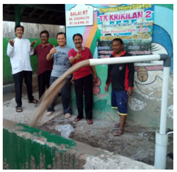
Figure 6. Initial step of water cleaning up