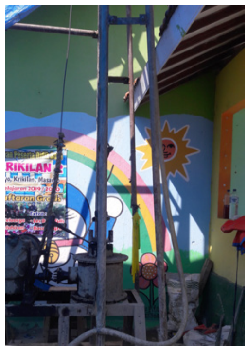
Figure 3. The location of well