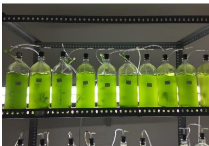
Figure 1. C. vulgaris in photobioreactor

The concentrations of Cd used in this study were 0, 0.05, and 0.1 ppm. Cadmium dioxide (CdO) was mixed in C. vulgaris growing medium with those concentrations. The repetition was carried out three times at each concentration. These treatments using heavy metal lasted for 14 days.