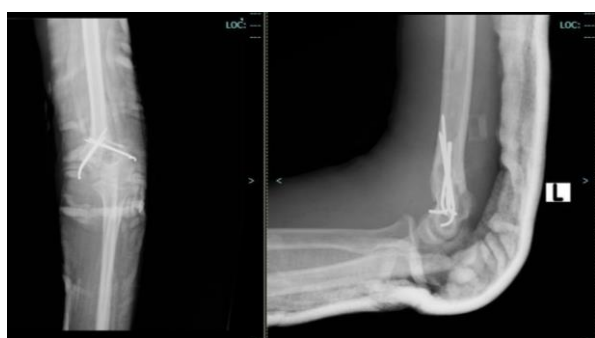
Figure 3. Postoperative X-ray AP and lateral view of left elbow.

and we found minimal soft callus at the fracture site. Open reduction was done, and the fragment fracture was immobilized using K-wire 1.6 mm on lateral and medial condyle. Post operatively, the patient was externally supported by using back slab in flexion position and arm sling, and x-ray of the left elbow AP and lateral view was taken for evaluation ( Figure 3 ).