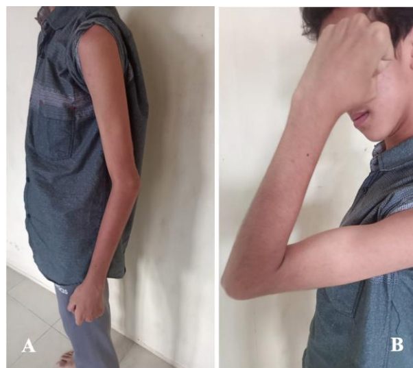
Figure 4. Two months after surgery, the range of motion were 20^\circ - 150^\circ of flexion.

In the two months after surgery, the range of motion were 20^\circ - 150^\circ of flexion ( Figure 4 ) and carrying angle was 5^\circ measured with a goniometer, and according to Flynn's criteria for grading ( Table 1 ) indicated satisfactory result.