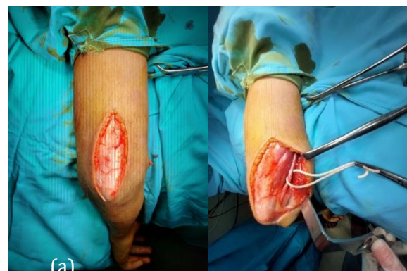
Figure 2. A median posterior incision was made on the midline of the elbow (a) and ulnar nerve was isolated during procedures (b).

The surgery was performed in operating theatre under general anesthesia by an Upper Limb, Hand, and Microsurgery Reconstruction surgeon. In lateral decubitus position, tourniquet was applied on the proximal of the fracture site. Firstly, thorough wound cleaning and debridement was done. Using posterior approach, a median posterior incision was made on the midline of the elbow ( Figure 2a ). The triceps muscle was splitted for exposing the fracture. During procedures, the ulnar nerve was isolated and preserved ( Figure 2b ).