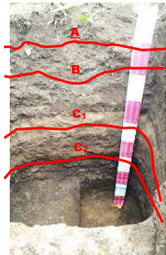
Figure 5. Soil Profile in The Gambar Agricultural Enterprise, Blitar, East Java.

The Mt. Kelud area has a mild climate with an average temperature of 24-26 C and is suitable for cultivating several types of crops. Water is available throughout the year with an average rainfall of 3,700 mm/year which is sufficient to support optimum agricultural production. The Mt. Kelud area belongs to a slightly wet climate, which affects the high speed of soil material decompositions. The soil fertility of the Mt. Kelud area is chemically classified as fertile (Table 3) based on the results of laboratory testing of soil samples taken from some layers in the soil profile (Figure 5). The pumice materials are categorised as high weatherable materials that release some inorganic chemical compounds to perform high base saturation soils. The only limitation is the low organic content which is relatively easy to improve through animal manuring. Therefore, agricultural activities should be combined with livestock activities so that the waste can be used for animal manure.