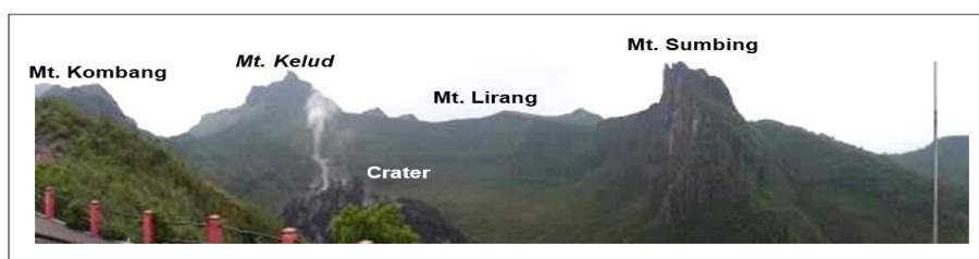
Figure 2. The irregular ridges that perform in the Mt. Kelud Peak.

The volcanic cone area does not perform as an ideal cone as a result of the past eruption events that are mostly explosive (Brotopuspito and Wahyudi, 2007). Igneous rocks that perform ridges around the crater formed the peaks of Mt. Kelud. These peaks have different names (Figure 2), such as Mt. Kelud (1731m), Mt. Gajahmungkur (1488m), Mt. Sumbing (1518m), Mt. Kombang (1514m), and Mt. Lirang (1414m). There are relatively flat areas at the inter-peak areas that make them suitable for specific economic activities such as tourism. The peaks, the Crater Lake, and the hot water have become the natural tourist attractions.