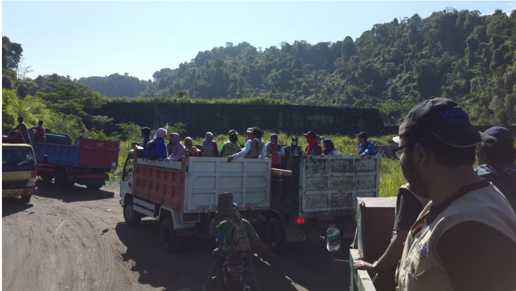
Figure 6. A new tourist attraction of the mining site.

Exploring the mining sites may require the cooperation of the sand truck drivers as this is a transportation mode to enter the mining sites. Visitors are offered a view of sand mining areas and the mining processes. The mining sector can earn extra income from tourist activities that can certainly improve the welfare of the community.