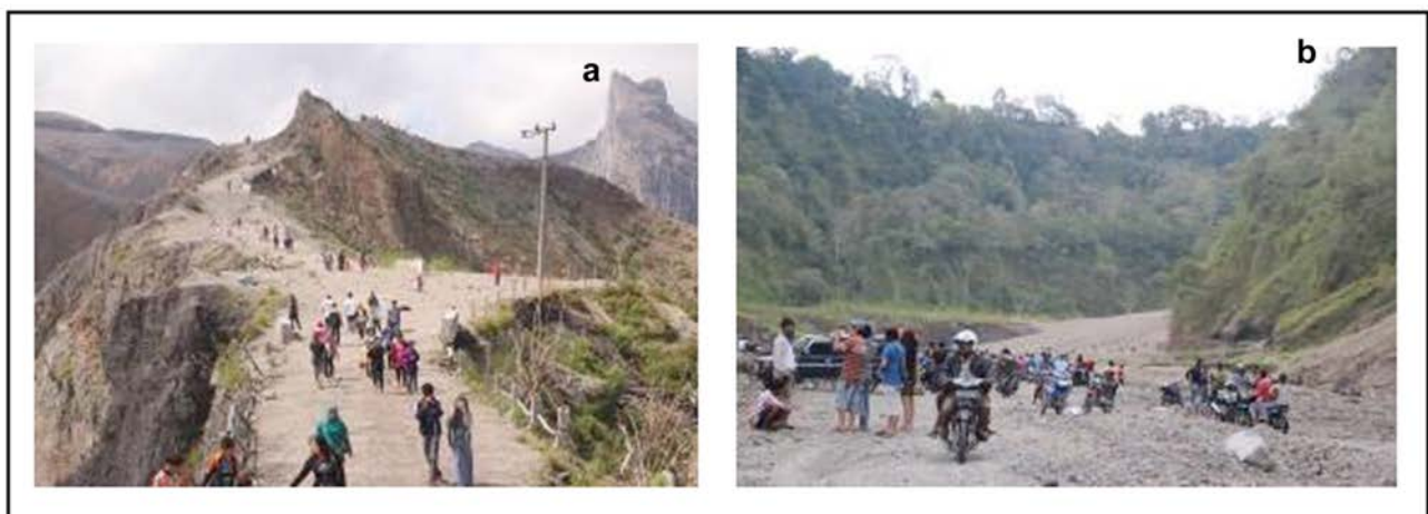
Figure 4. People want to visit Mt. Kelud after the 2014 eruption. (a) Landscape attraction formed in peak of Mt. Kelud; (b) Pumice sediment in the upstream of Kaliputih River.