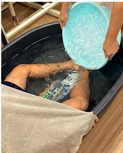
Figure 2. Cold water immersion (CWI)

The subjects were immersed in cold water at their hip level by sitting in a plastic tub. They were immersed in 2 different temperatures of cold water, the first 3 minutes at 15-20°C for familiarization and the second 5 minutes at 8-10°C for the main CWI protocol. The CWI was given once, before the second running session. A glass thermometer was used to constantly monitor the temperature of the cold water.