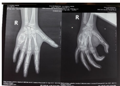
Figure 5. Post 3 rd methylprednisolone injection X-Ray

The dose of the steroid based on volume of the lesion. The first injection we injected 3 mL contains 187,5 mg methylpredsolone. The second injection injected 2 mL contains 125 mg of methylrednisolone. The third injection injected 1 mL contains 62,5 mg of methylrednisolone. Then we do clinical (figure 4) and radiological evaluation after complete treatment (figure 5).