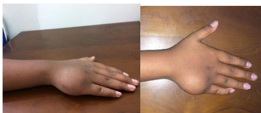
Figure 1. Clinical photograph of patient

A male child presented with lump on his back of right hand. The lump appeared since two months before admission, getting bigger by time and also pain. There was no history of trauma, night pain, loss of appetite, and loss of body weight. His past medical history was hemophilia and under controlled by pediatric department. The patient also had the normal growth and development.