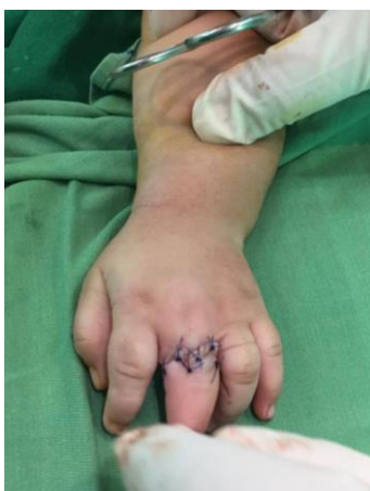
Figure 5. Release surgery of constriction ring band of proximal phalanx of middle finger of left hand.

We performed below knee amputation for left leg and a release surgery of constriction ring band of proximal phalanx of middle finger of left hand (Figure 5).