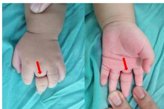
Figure 1. Constricting band on proximal phalanx of middle finger of left hand (red arrow)

A four-months male child came with his mother to pediatric orthopaedic clinic with complaint of swollen amputation stump of left leg and constricting band on his leg (Figure 2). On the stump of left leg initially was a small lump. Over time the size of the stump got bigger than its first appearance, and wound with pus appeared. Other deformities were constricting band on proximal phalanx of middle finger of left hand (Figure 1), acrosyndactyly of first and second toes of right foot (Figure 9), and congenital scrotalis hernia since birth. There was no history of trauma before.