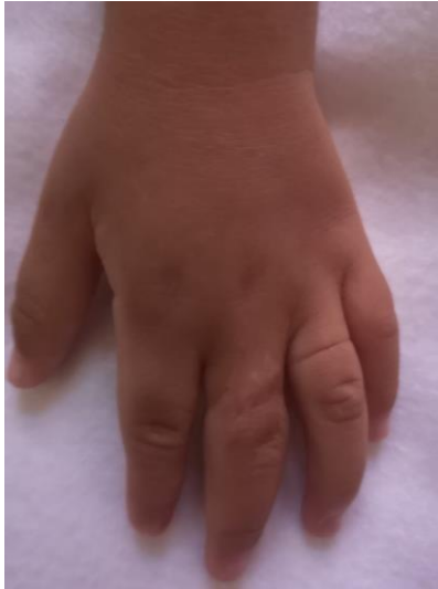
Figure 8. The clinical picture of one year follow up of left hand. There was the wound scar with good viability of middle finger.