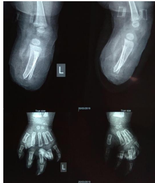
Figure 6. X-ray of left cruris AP lateral following amputation surgery and x-ray of left manus AP and oblique after release surgery of constriction ring band of proximal phalanx of middle finger of left hand.

Patient's follow up after 1 month following operation revealed good outcome. The wound was healed, there was no pus and sign of infection. Three months follow up showed that the stump was in good condition and good shape which was suitable and ready for prosthesis fitting (Figure 7). The wound at proximal phalanx of middle finger of left hand was also in a good condition, viable, and well functioned (Figure 8). In twelve months follow up, the patient was able to walk and use his hand well, there was no complain or any restriction on his activity daily living (Figure 9).