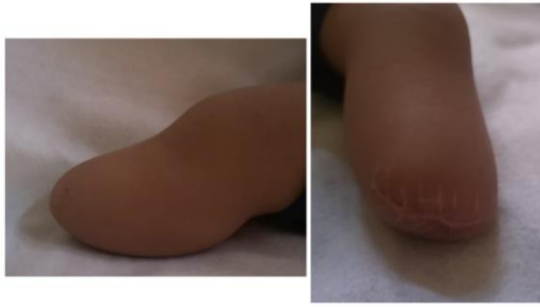
Figure 7. the clinical picture of one year follow up of the amputated stump..