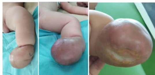
Figure 2. Amputation of left leg and constricting band.

Physical examination of the left hand showed constriction band on proximal phalanx of left hand with skin intact, redness, swelling, there was no neurovascular disturbance, CRT < 2 seconds, ROM of middle finger was limited. The left cruris showed amputated stump of left leg, swelling, redness, with wound size 2 cm x 4 cm, irregular border with pus. There was tenderness and we could not evaluate the neurovascular disturbance. X-ray of left hand AP and oblique showed normal bone structure of all digits. (Figure 3).