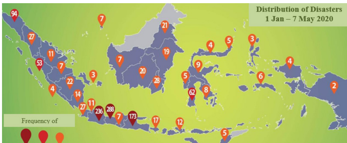
Figure 1. Distribution of disasters in Indonesia (BNPB, 2020)

Although government always works with other stakeholders (domestically and internationally) to counter disasters, success or failure will greatly depend on government policies both in its anticipation and response. In a previous paper (Darmastuti and Rosalia, 2019), we presented the argument that although the government has developed a multi stakeholder partnership (MSP) with local community-based organizations (CBO), non-government organizations (NGO), professional groups and other groups, its failure to develop a network partnership (a strong institutional partnership between government institutions and other disaster stakeholders) has created a critical situation in countering tsunami. Therefore, it is important to study in more detail how the government could develop institutional arrangements to counter disasters in a better fashion.