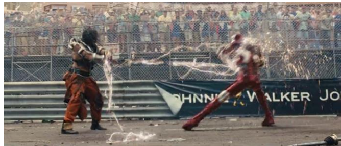
Frame 3.4 Tony fight against Vanko and win

Scene 3 Vanko versus Iron Man (00:35:37 - 00:36:52)