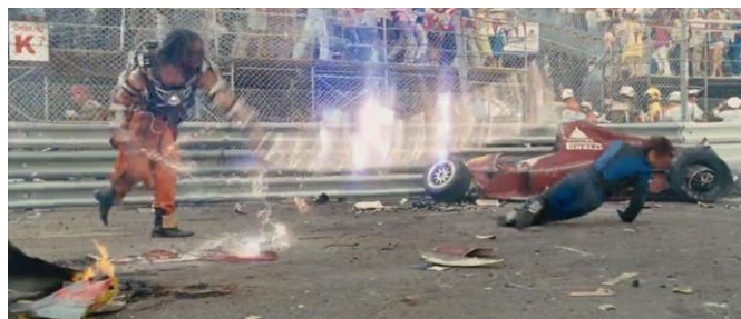
Frame 3.2 Vanko tries to kill Tony with his weapon