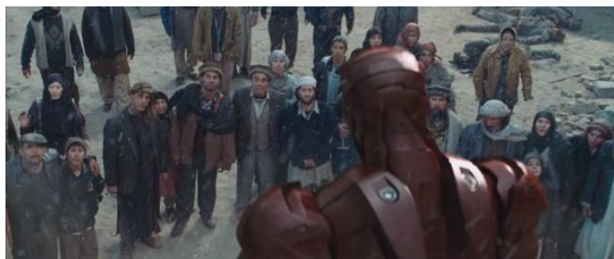
Frame 4.4 Iron Man leaves civilian after defeated bad guys

Scene 4 Iron Man beats the bad guy and save civilian (01:17:27 - 01:18:27)