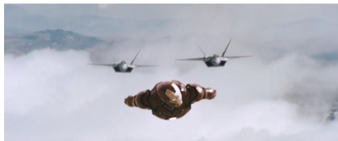
Frame 1.2 Two F-22 Raptors appear behind Iron Man