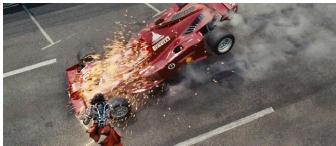
Frame 3.1 Vanko enters formula rice and destroys Tony's car