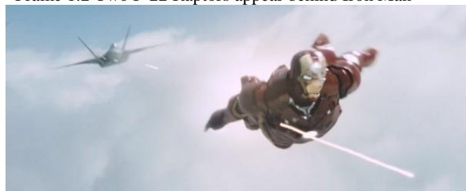
Frame 1.3 F-22 Raptor fires Iron Man