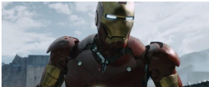
Frame 4.1 Iron Man appears during bad guy invasion