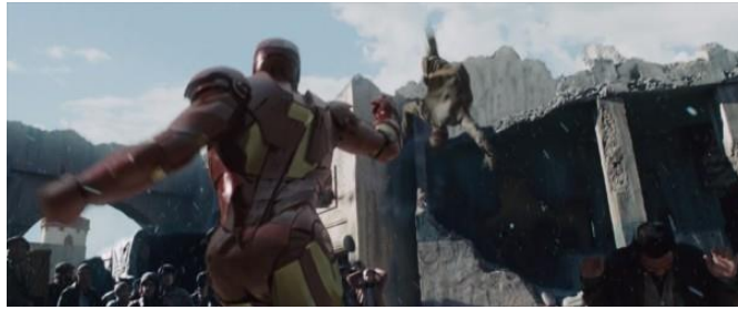
Frame 4.2 Iron Man beats bad guy one by one