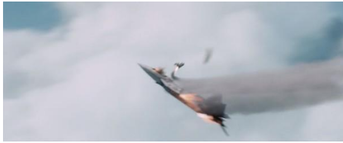
Frame 1.4 F-22 Raptor crash with Iron Man

Scene 1 Iron Man versus F-22 Raptor (01:19:26 - 01:23:05)