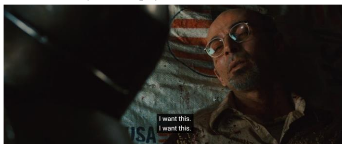
Frame 2.1 Yinsen dying and talking to Tony