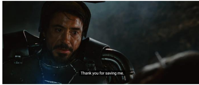
Frame 2.2 Tony get angry after Yinsen's death

Scene 2 Yinsen death scene (00:37:50 - 00:38:35)