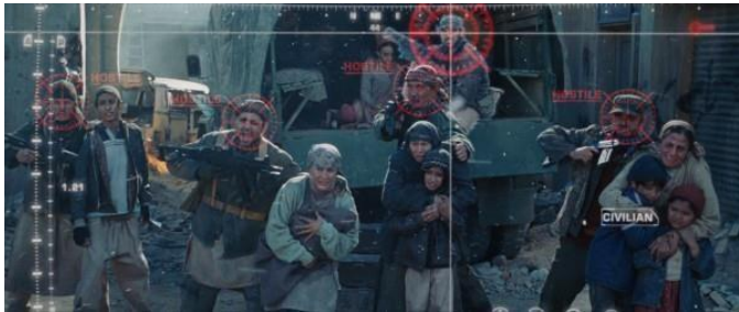
Frame 4.3 Sophisticated Iron Man's weapon aims at bad guy's head by scanning