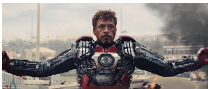
Frame 3.3 Tony wears his Iron Man Suit