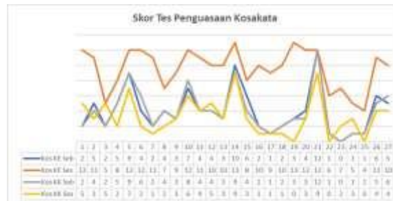
Figure 1. The Score of Vocabulary Mastery

between the result of pretest and posttest in vocabulary mastery and psychomotor ability ( H_1 is accepted). On the contrary, there was no significance score in the control group between the result of pretest and post-test in vocabulary mastery ( p=0,081 ) and psychomotor ability in the control group. The chart below shows the result score of students' vocabulary mastery.