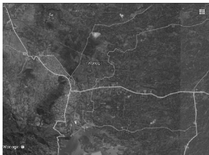
Figure 2. Maps of Wonogiri District.

Pracimantoro disposal site is located in Gebang Harjo village, with the coordinate point - 8.049819, 110.78047. Pracimantoro landfill has an area of about 512 m 2 with a rocky road access. The landfill distance to the nearest settlement is approximately 600 m. The settlement around the landfill has a not-too-dense population. The landfill is surrounded by more than 15-ha buffer zone area. The area of agriculture around the