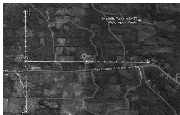
Figure 4. Map of Baturetno disposal site.

landfill is more than 10 ha. Figure 3 shows Pracimantoro landfill area.