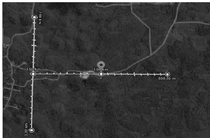
Figure 3. Map of Pracimantoro disposal site.