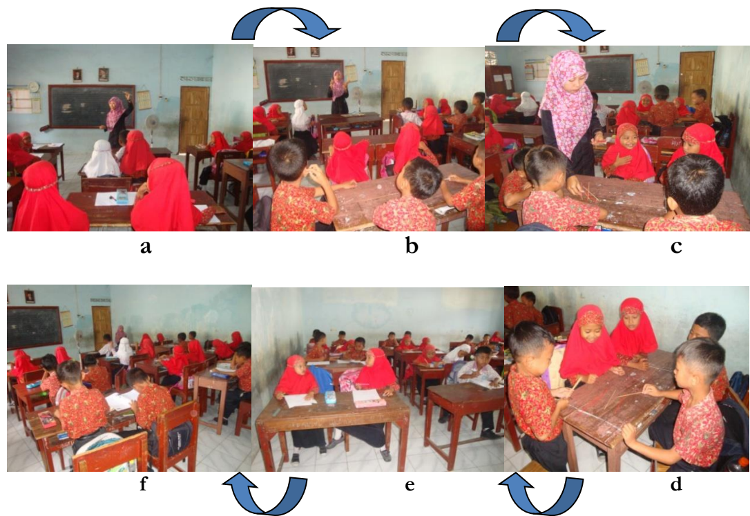
Figure 2. Activity Learning Process per Cycle

This study is in line with some previous research studies conducted by Kurniawati and Ardianingsih (2015) which states that there is a significant influence on the modified traditional game bandaran to the learning outcomes of children with autism math grade 2 in SLB Autism Mutiara Hati Sidoarjo. This study uses the same traditional games. Through this study, the use of traditional games can stimulate students to think critically and explore the concept of arithmetic discovery through play Pathilan. The researcher stimulates students' understanding of the concept through an open question. Further activities in research Pathilan game is described as follows: