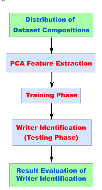
Figure 2. Research Stage of Writer Identification

Writer identification is the recognition of the writer based on handwritten-character by matching of an unknown handwriting sample to the sample of data for which the writers have been known previously. The identification process is done by counting and comparing feature of handwritten samples with a feature database that has been stored. The results of identification of the most similar writers will have the highest level of similarity [23]. Two approaches for writer identification are to analyze based on characters and the approach by using textures from documents [24]. In this study, the proper approach is to use Principal Component Analysis (PCA) analysis to character images.