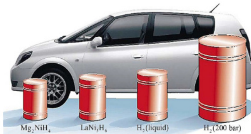
Figure 1.1 Volume of 4 kg of hydrogen compacted in different ways, with size relative to size of a car (Image of car of Toyota press information, 33rd Tokyo Motor Show, 1999 [5]).

mass transfer and the hydrogen adsorption and desorption processes is critically important.