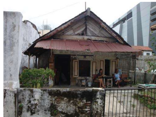
Picture 6. Physical condition one of the houses in Kampung Sekayu

There are several aspects that distinguish Kampung Sekayu from other original Semarang villages, namely the existence of an original element in the form of a mosque left by the Wali. At-Taqwa Sekayu Mosque, which is an old and historic building, was built around 1413 by Kyai Kamal as a trial mosque before the Demak Mosque. Kampung Sekayu is one of the oldest villages in Semarang, Kampung Sekayu used to have a function as a wood-gathering village for the construction of the Great Mosque of Demak, so the majority of the original buildings in Kampung Sekayu used teak wood. The original building, which was built in colonial times, features a pyramid roof, and arrow-shaped ventilation holes. This native house which has a typical Semarang character can be seen in Figure 6.