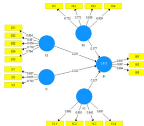
Figure 2. UTAUT Model first step

In Figure 2, it can be seen that the loading factor of each instrument is above 0.5 which indicates that the value of all instruments is valid. The next validity test is to test convergence by paying attention to the Average Variance Extracted (AVE) value of each instrument. In Table 2, it can be seen that the AVE value of each indicator of this model is worth more than 0.5 so that the indicators used have reached the minimum standard of convergent validity test.