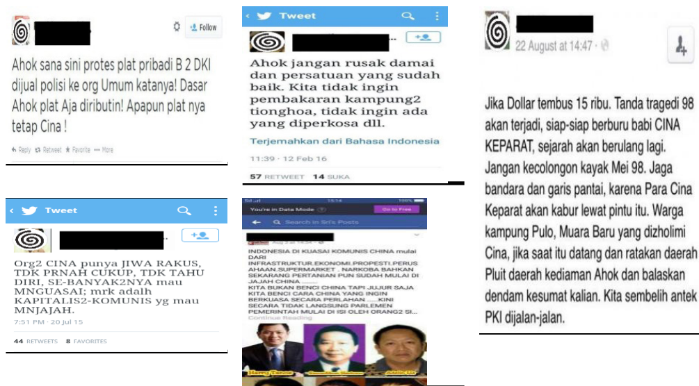
Figure 2. The Examples of racial expression on social media against Ahok (Google Image)

One interesting thing to note, however, is that the racial sentiments that emerged during the 2017 Jakarta governor contest were dominated by racism channeled through social media in the form of racial-smeared campaign content. Although it cannot be directly concluded that such conditions fully represent the reality of true binary opposition, it can be said that the digital age has provided a new space for tribal polarization in society. Freedom of expression and voice in a democratic climate are supported by technological advances, also followed by the spirit to hate and act racist. In the case of Ahok, it is felt that the mobility to voice racial and hate speech against the Chinese gubernatorial figure is done by massively spread Buzzer and volunteers in social media. See figure 2: