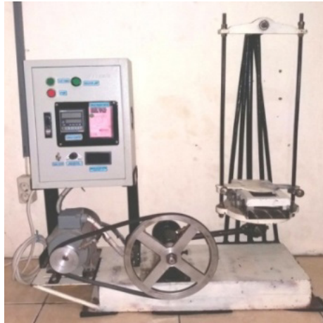
Figure 2. Shaking machine

The milling process was conducted for 2 million cycles at 900 rpm of driving motor.