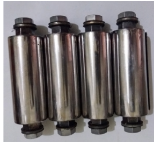
Figure 1. Vials to conduct milling process