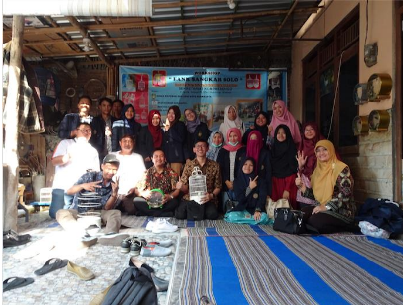
Figure 3. Comparative Study to ENAK SANGKAR SOLO SMEs