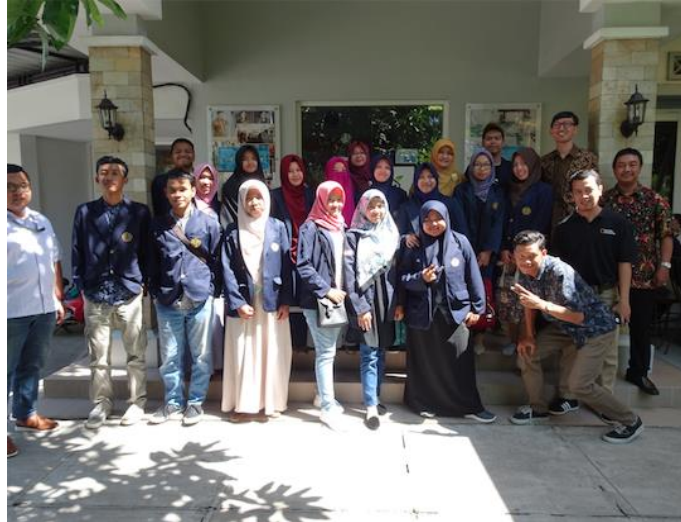
Figure 2. In class and Outclass Training

Entrepreneurship training is carried out with a lecture model from experts and KDP teams. Training Materials include the following knowledge and theories: